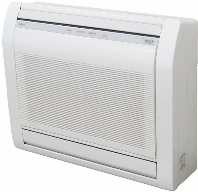
Multi Zone Mini-Splits – Indoor Units