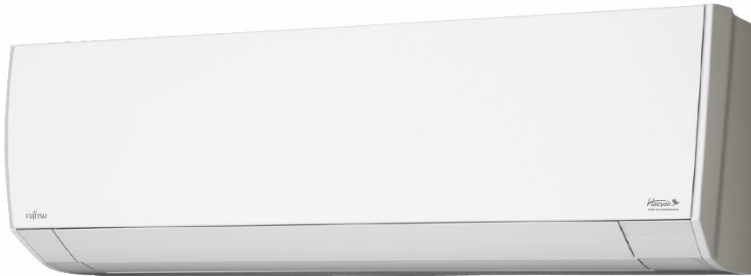
Large Wall Mounts